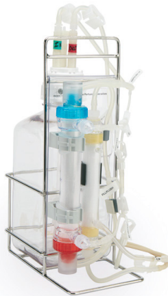
• HF Primer™

Achieving high cell densities and reducing the costs to produce biologics are desirable but not always simple or inexpensive goals. C3's hollow fiber bioreactor systems are a solution to both goals. C3 has four hollow fiber bioreactor (HFBRx) systems to address a wide range of production applications. We offer one small-scale system, two pilot-scale systems and one production-scale system.